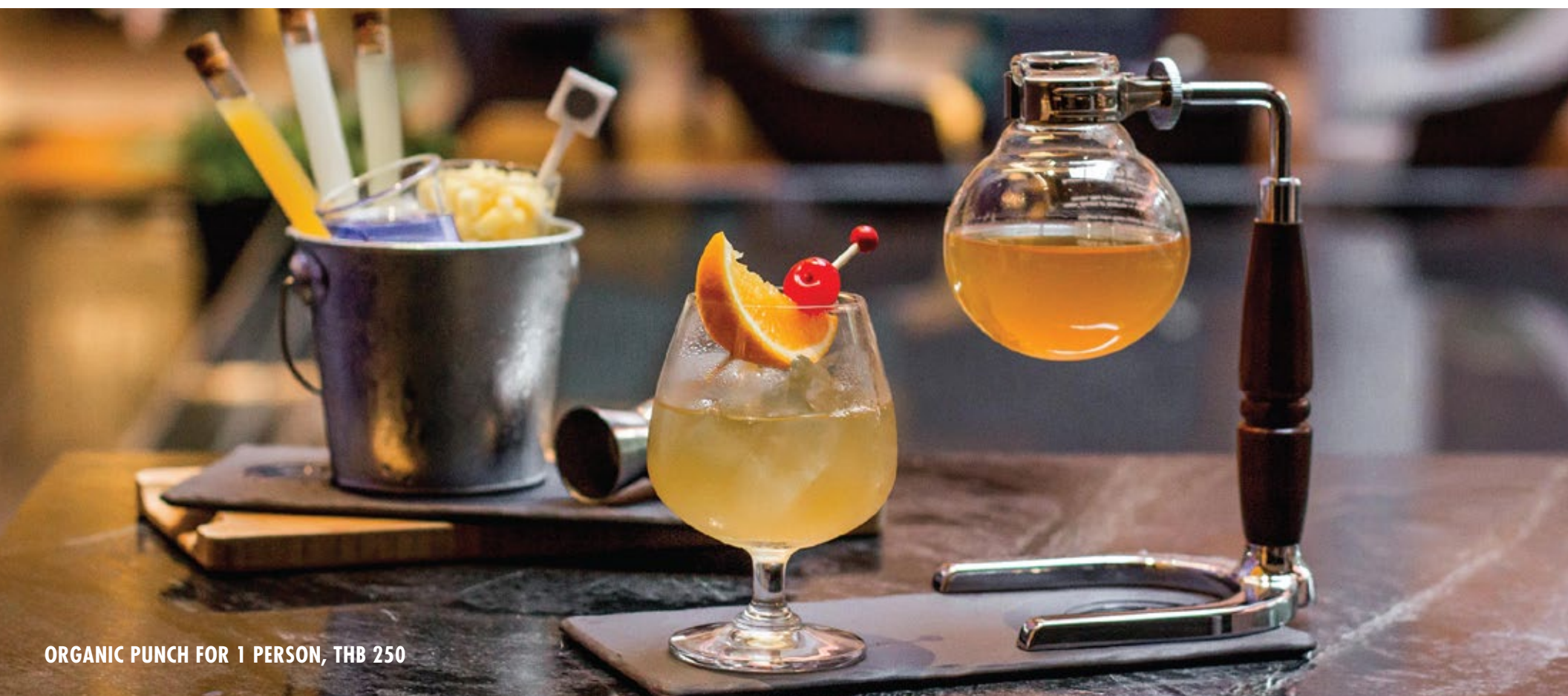
ORGANIC PUNCH FOR 1 PERSON, THB 250