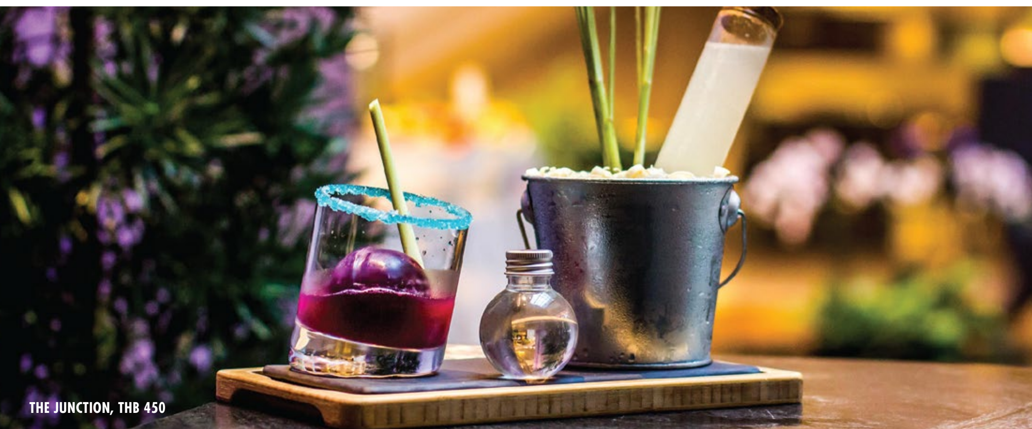
THE JUNCTION, THB 450

Glenmorangie 10 yrs. 460 5,800 Glenfiddich 12 yrs. 400 6,400 Singleton 12 yrs. 550 7,500 Glenfiddich 15 yrs. 550 9,000 Talisker 10 yrs. 650 11,000 Glenfiddich 18 yrs. 550 12,000