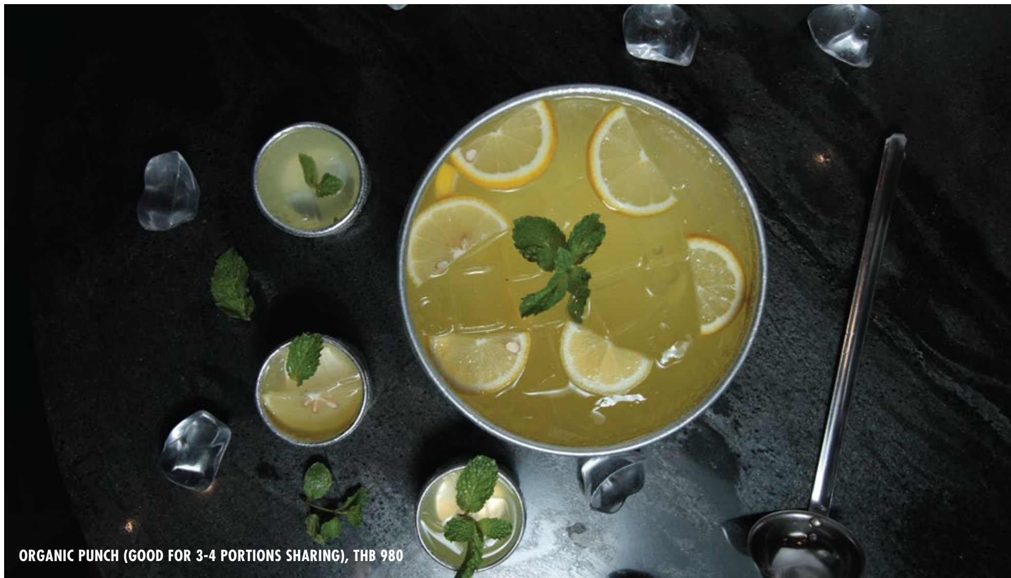
ORGANIC PUNCH (GOOD FOR 3-4 PORTIONS SHARING), THB 980