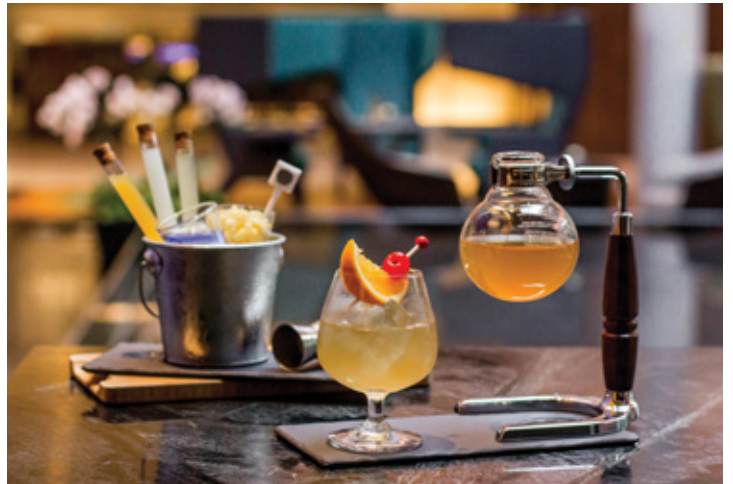
ORGANIC PUNCH THB 450