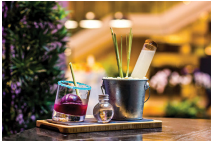
THE JUNCTION THB 450