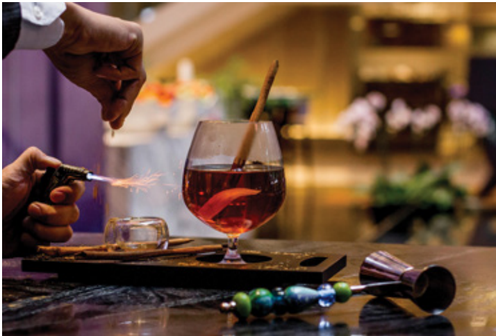
BETWEEN CLAM & PASSION THB 450