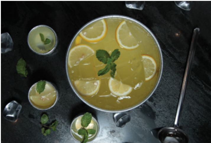
ORGANIC PUNCH (GOOD FOR 3-4 PORTIONS SHARING) THB 980