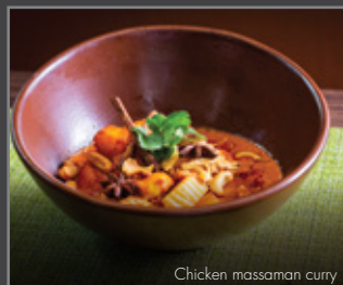
Chicken massaman curry