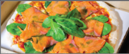
Salmon and Fresh Rocket Pizza