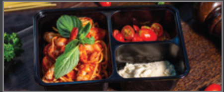
Tomato with Seafood