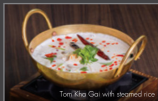
Tom Kha Gai with steamed rice