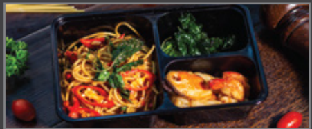
Phad Krapraow Talay

(Stir Fried Pasta with Seafood and Thai Basil)