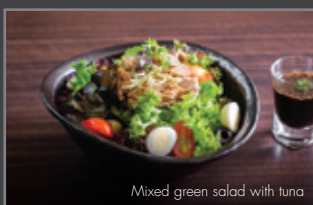
Mixed green salad with tuna