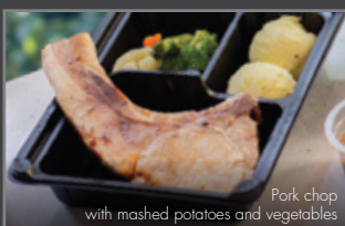
Pork chop with mashed potatoes and vegetables