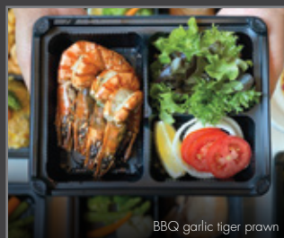
BBQ garlic tiger prawn