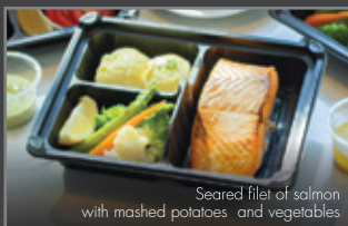
Seared filet of salmon with mashed potatoes and vegetables